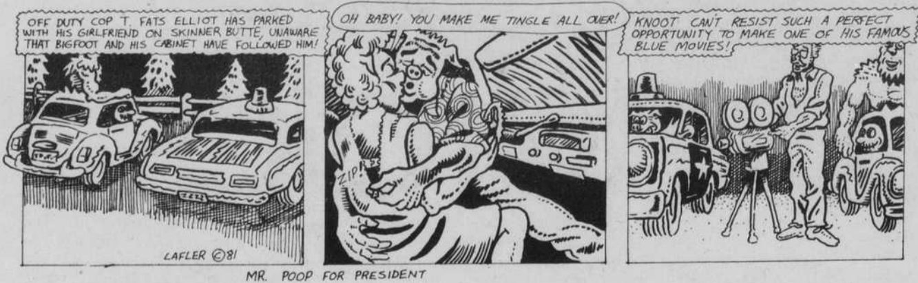
MR. POOP FOR PRESIDENT