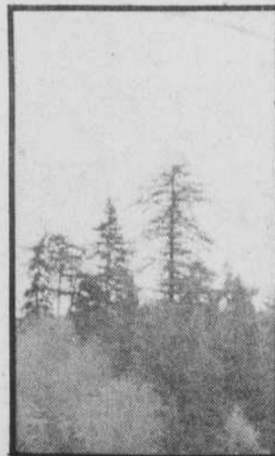
BEFORE cluttered mountainside

WITHOUT ERRANT JONES, THESE TREES WOULD BE FOR THE BIRDS.