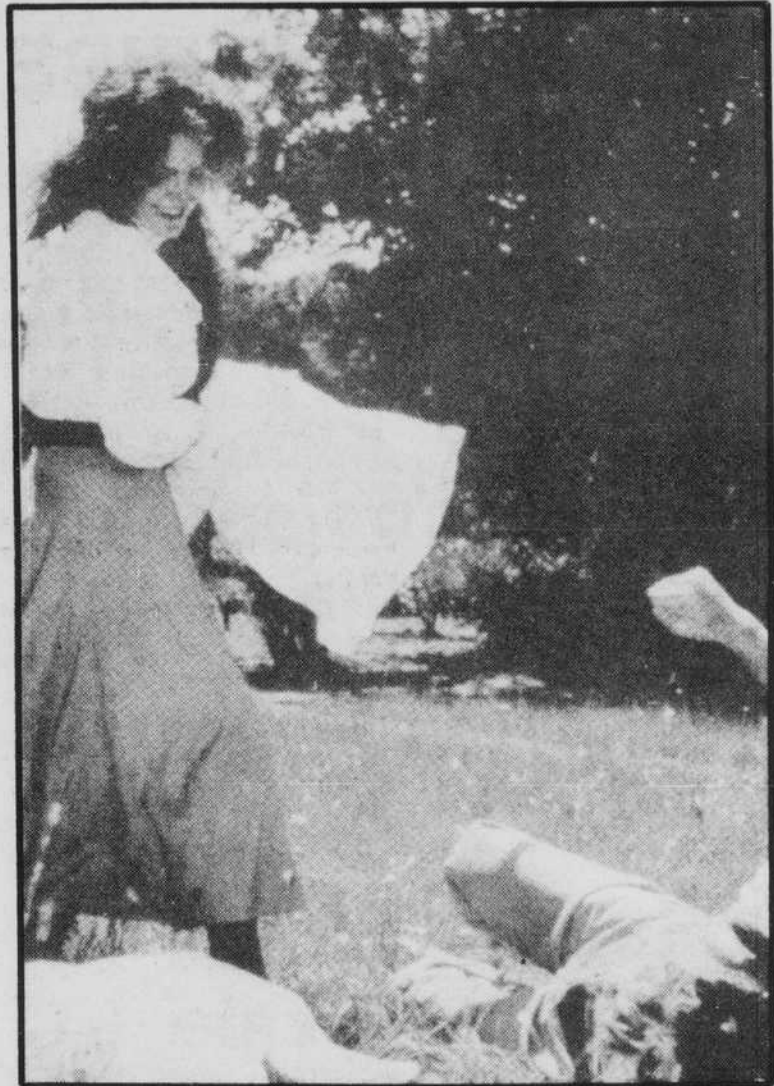
My Brilliant Career