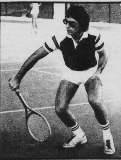
Tennis Doubles Tournament This Saturday

Basketball Intramurals have been underway now for a week. Every afternoon gyms in Esslinger and Gerlinger Annex are packed with students playing in men's, women's, and co-ed leagues. Unfortunately due to budget cutbacks not all teams were able to be scheduled into officiated leagues. However, the 20 teams in Division III (unofficiated) do have the opportunity to have a season of intramural play.