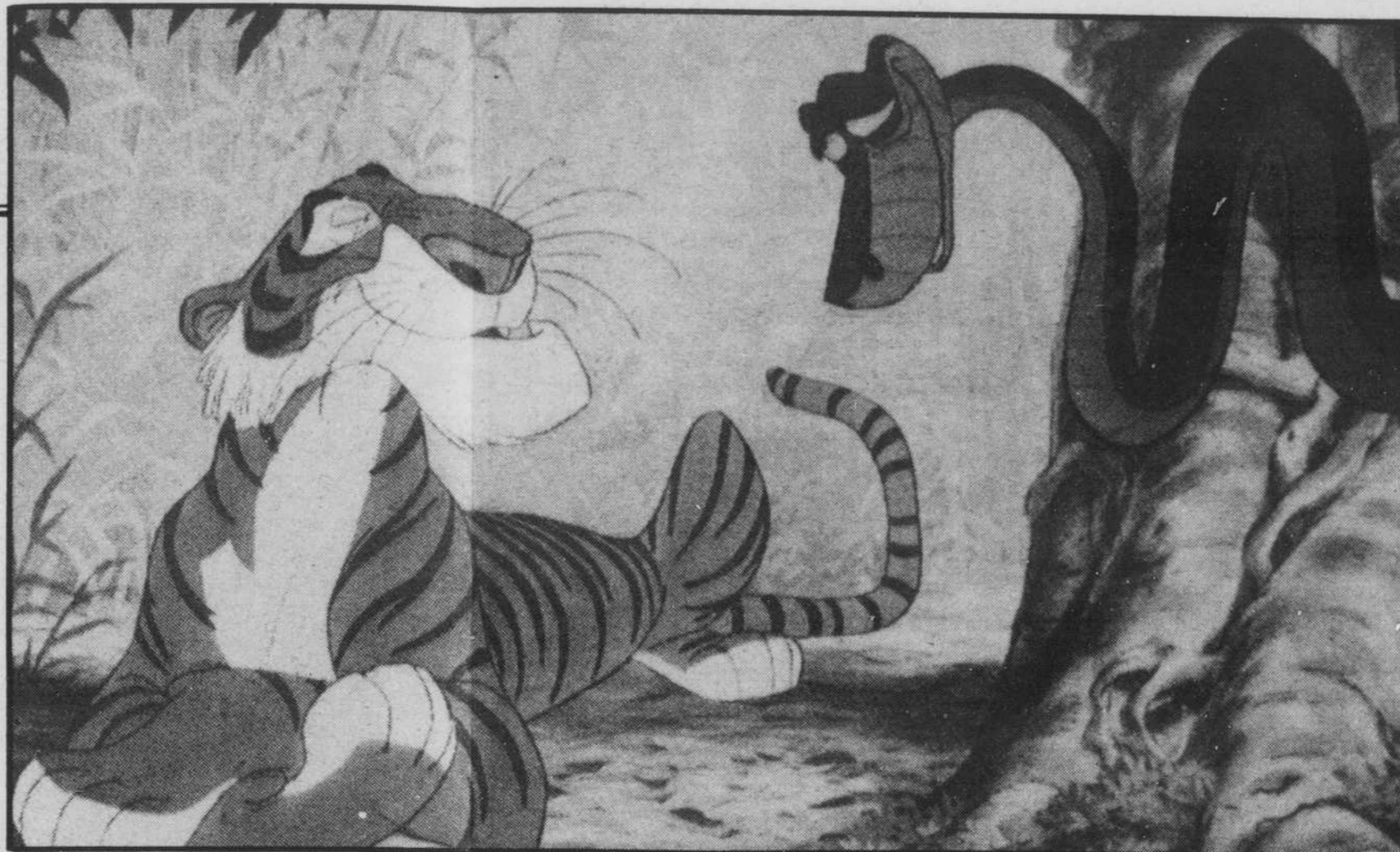
Walt Disney's animated "Jungle Book," based on the Rudyard Kipling stories, plays on campus Friday.

FILM "Don Giovanni" (See Thursday's listing) KOZY-TV, Cable 11: "The Virginian" at 8 p.m. "Artist and Models" at 10:30 p.m.