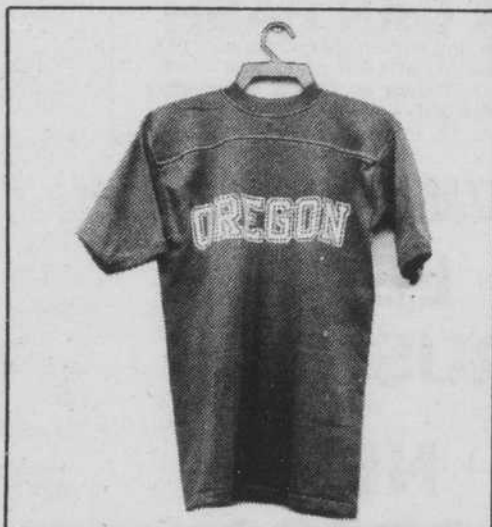
U of O Green T-Shirt