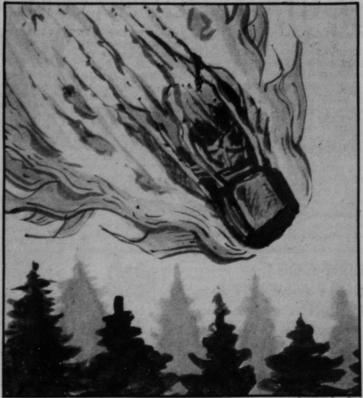
Graphic by Tom Ettel

The latest NASA prediction, which changed the date of re-entry from Friday, July 13, to today, says the space station should begin breaking up over the Northwest sometime in the evening and will finally hit the ground nearly 5,000 miles away.