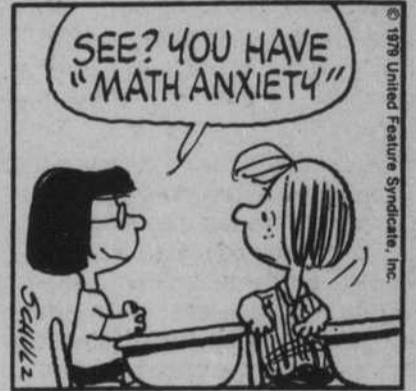
© 1979 United Feature Syndicate, Inc.