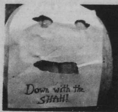
Photo caption: Customs differ. This Jock-O-Lantern, along with numerous other decorations, dances and gala chants, is part of Iran's ongoing Halloween celebration. Story Page 31.