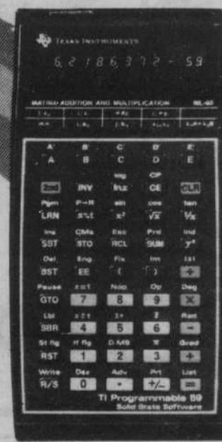
$299.95* TI Programmable 59

The Sourcebook for Programmable Calculators is a new book from Texas Instruments designed to help you explore the power of your programmable calculator. Contains over 350 pages covering step-by-step programmed solutions to problems in a wide range of fields. And it's yours free, if you act now.