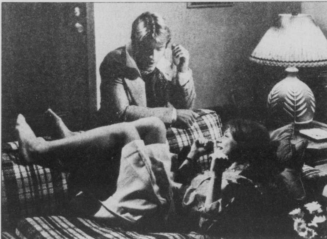
King &amp; Foster in A Different Story