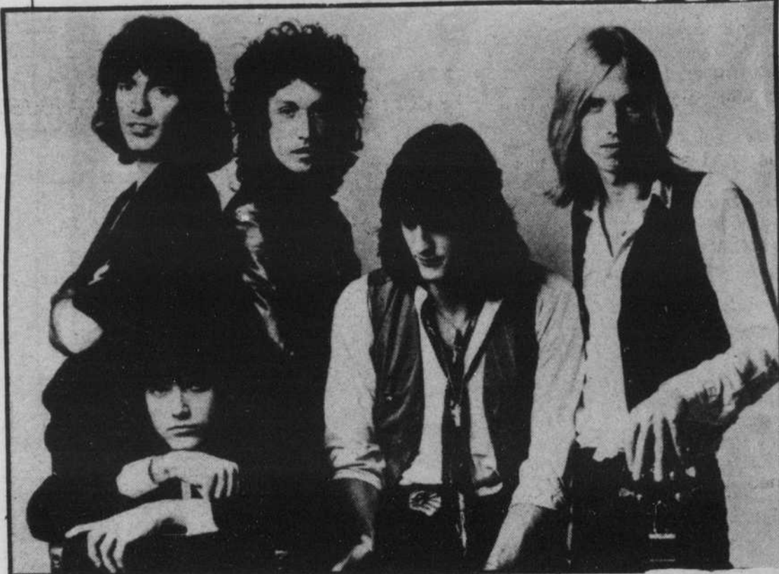
Tom Petty and the Heartbreakers

"I don't have a razor blade. I've got a guitar. I mean, great, if you want to go out and burn Buckingham Palace, fine. But when you go out on stage that night, you'd better play. You just gotta back it up. If you don't you're just jive."