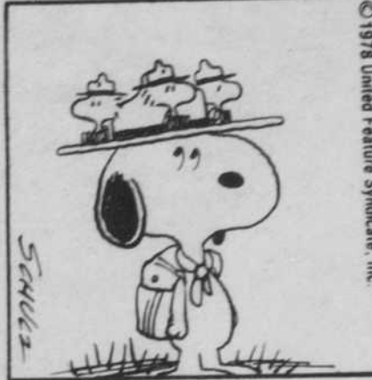
© 1978 United Feature Syndicate, Inc.