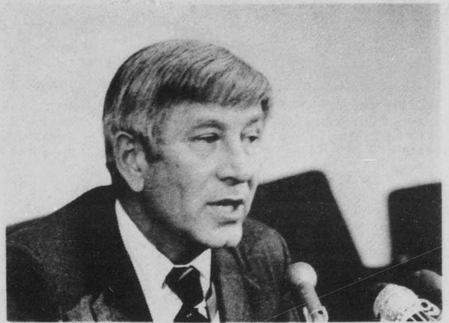
Congressman Jim Weaver: China deficient in timber

Weaver said even though Japan is a timber-short country,