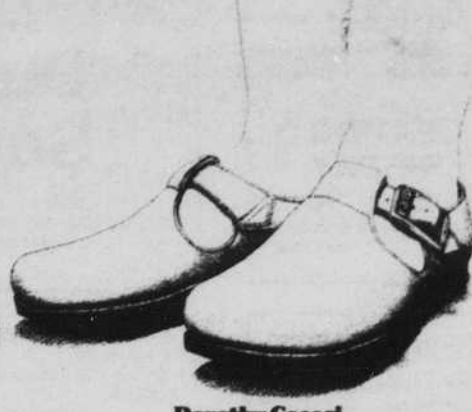
Dorothy Cacest Housewife

style 300 antique russet/smooth black/smooth