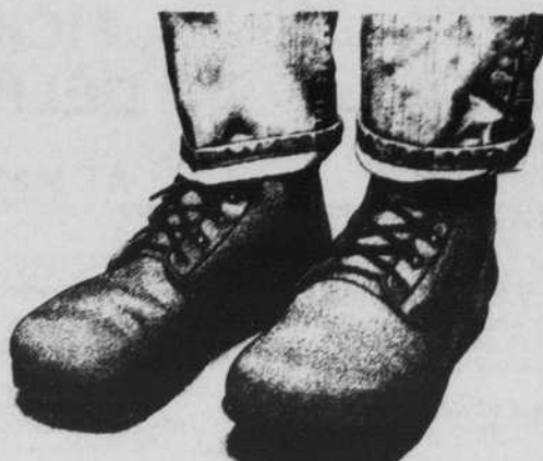
Craig Wink College Student