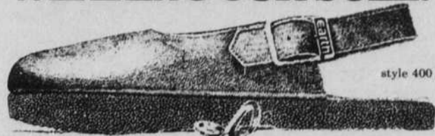
style 400 brown/softie

IN YOUR HEART YOU KNOW YOU SHOULD BE WEARING OUR SOLE.