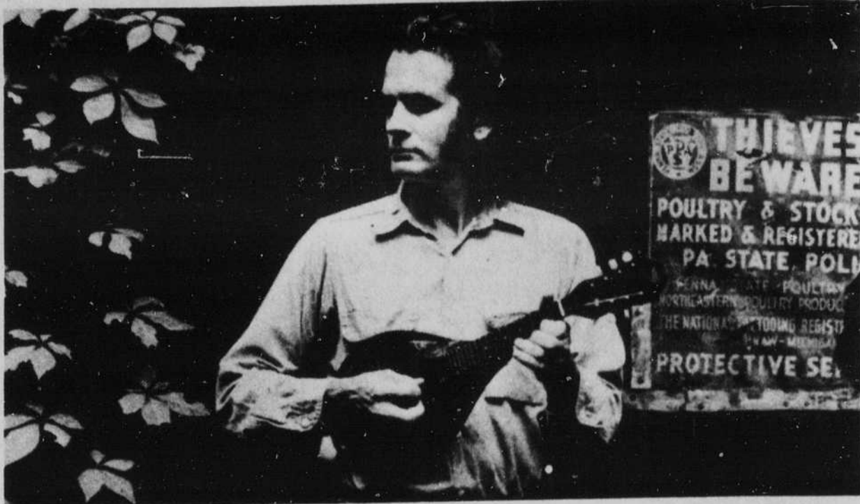
Mike Seeger, an extraordinary folk musician and historian will teach and perform this Sunday at the CCPA. See related article on Page 5 Section B.