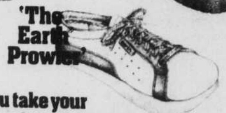
'The Earth Prowler'

To help you take your first step in the shoe that revolutionized walking, we're having a sale. Save from 15% to 35%