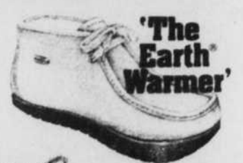
'The Earth Warmer'