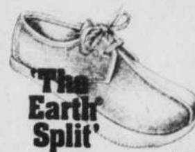
'The Earth Split'