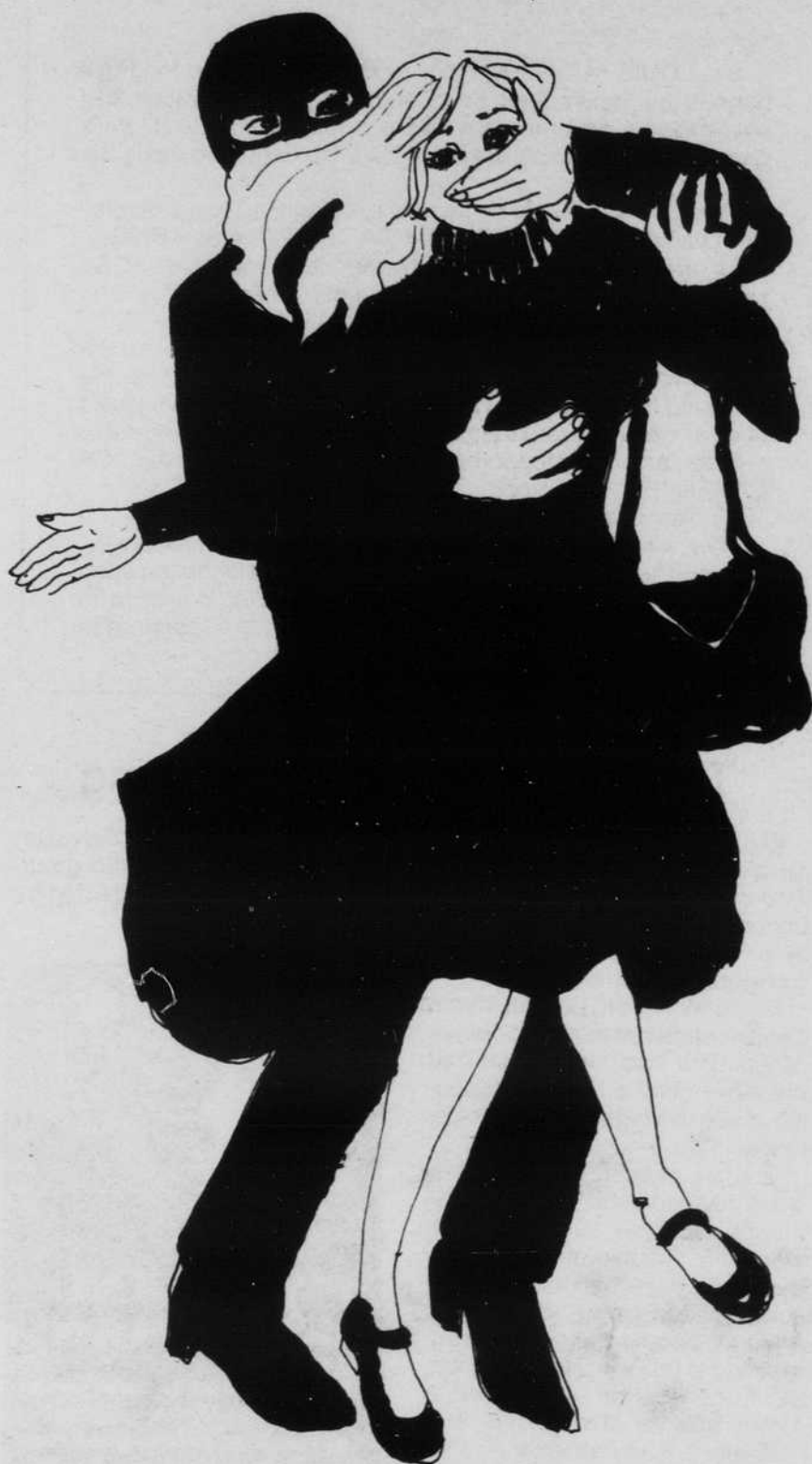
Drawing by JoAnn Fahlgren