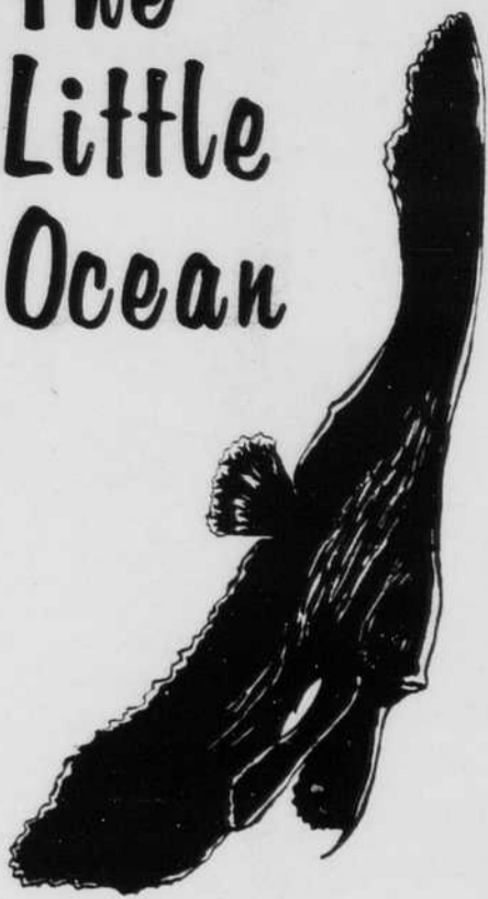
Platax pinnatus Black Batfish