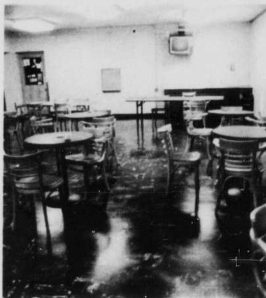
The lower floor houses a large reading and study room. Turn right when you reach the bottom of the stairs leading down from the main lobby.

Look to the Outdoor Resource Center or the Outdoor Program office for complete information about outdoor sports and recreation.