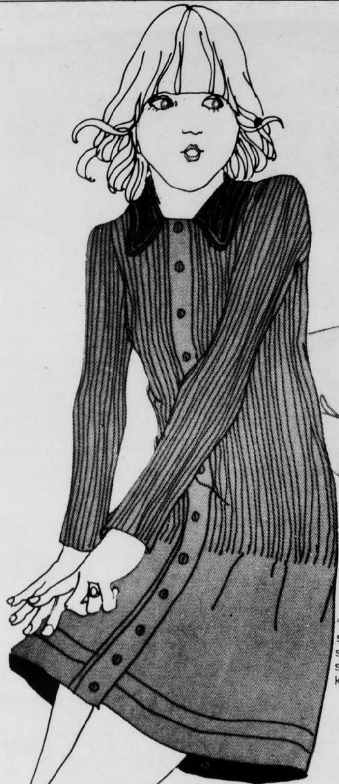
'Middy' dress sports ribs, stripes, belled sleeves. Acrylic knit; 5 to 15. $14