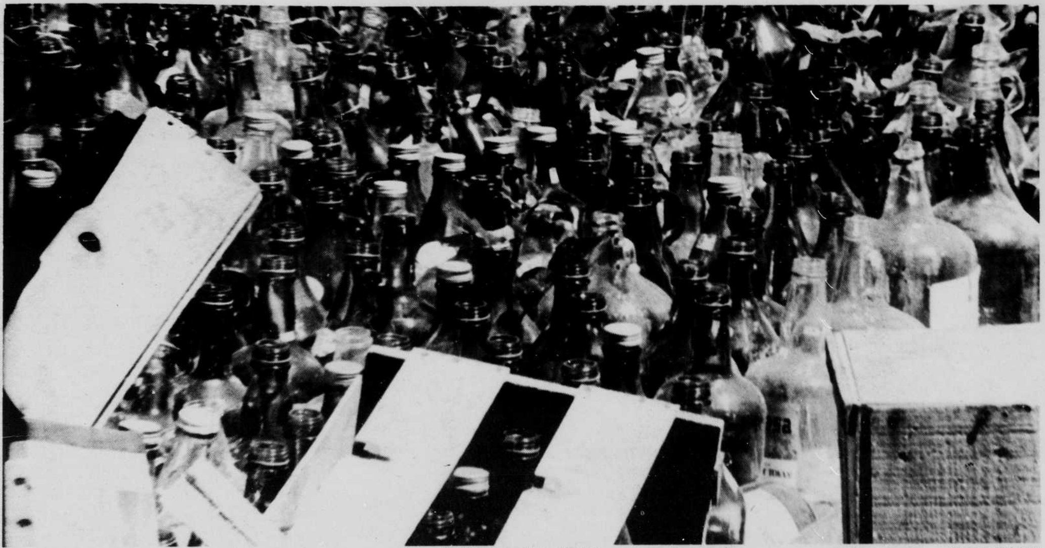
Bottles brought to BRING.