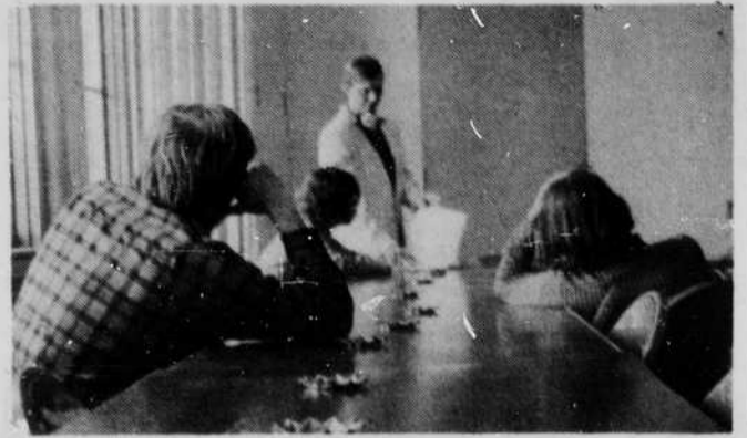
The President de-briefs his cabinet in preparation for his 5:30 State of the University Address. (Table ash-trays optional at minimal handling costs).