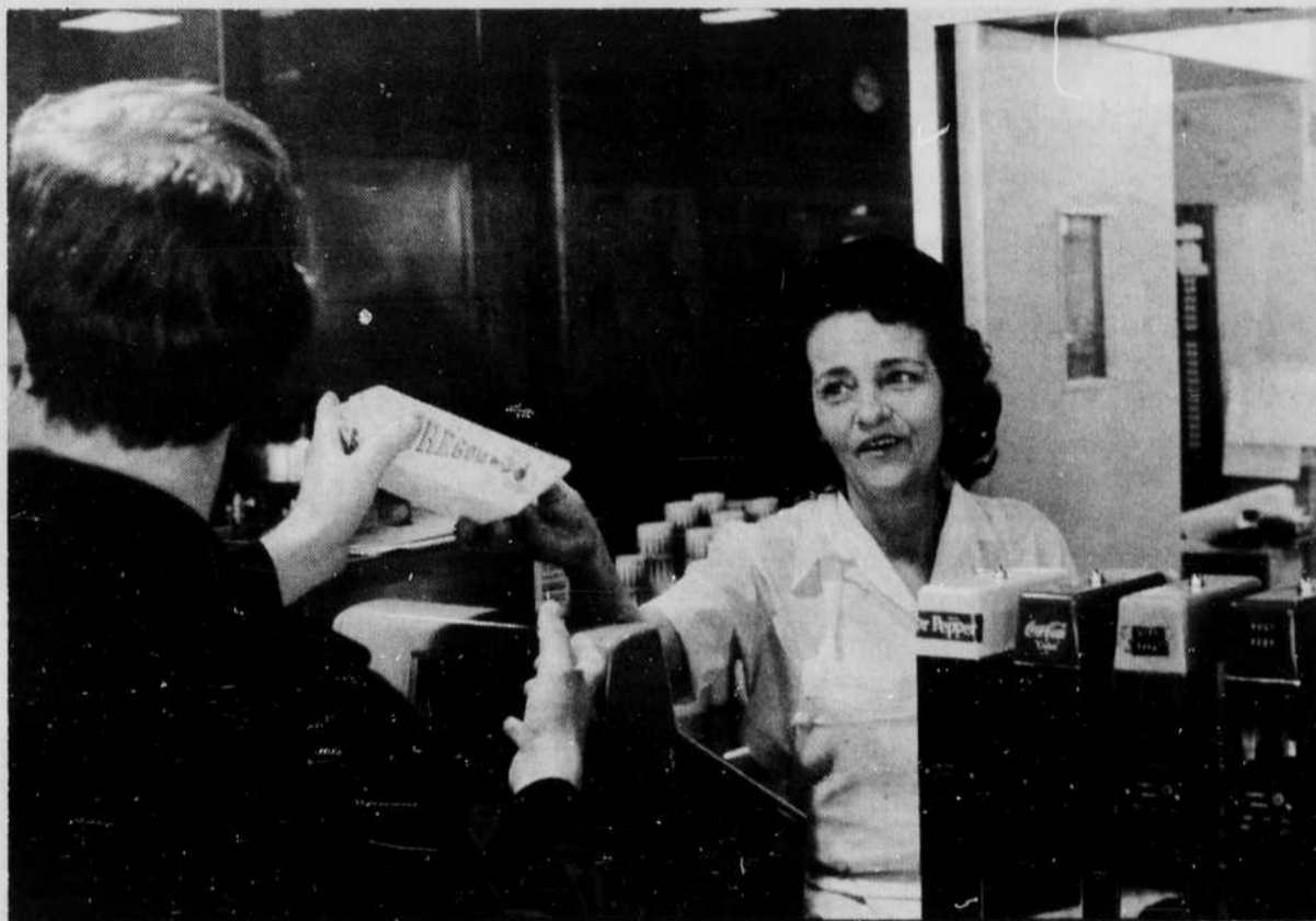
During his day as Commander and Chief, our President will have at his disposal, the army of culinary workers who help to keep the (student) Union strong. Here, our President grabs a free burgerbasket fit for a king (which he truly is) and heads to the basement for a free line of bowling and a little R & R.

The most prized possession of your Presidential Packet (and perhaps of your lifetime), this important document tells the story of your college career as well as your past Presidential stature. (The transcript feature of the President-For-A-Day packet is optional and may be substituted for the text of an anti-war speech written by real professionals employed by our sister company, Famous Writer's School. This will prove to be invaluable to those seeking work with progressive employers.