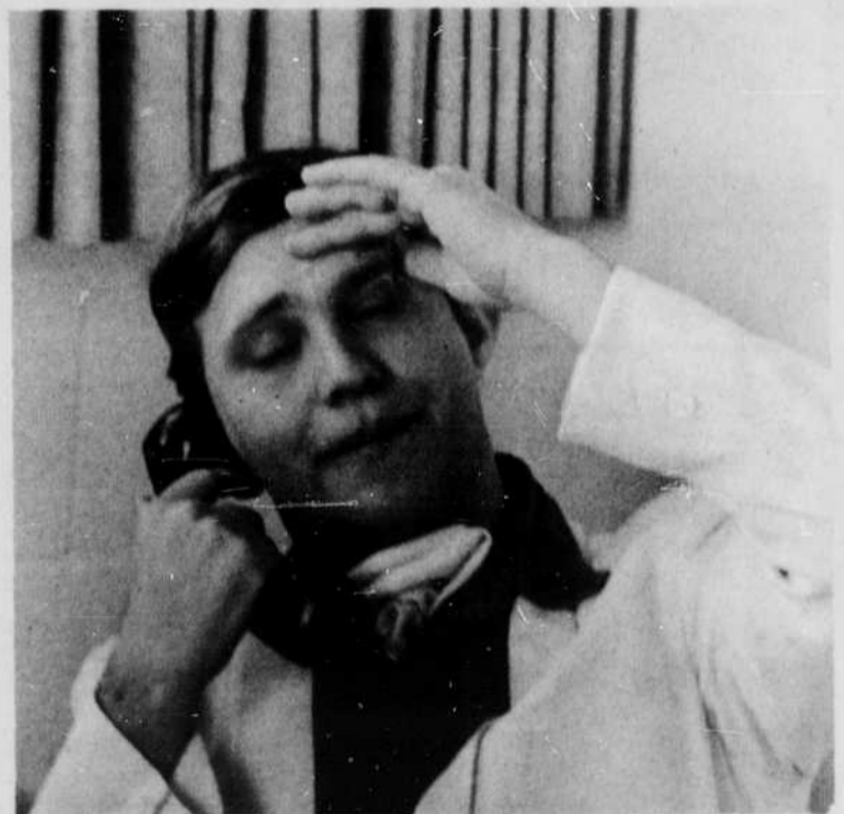
Boy, it's been a day, but it sure has been worth it. Your day as President, and, more specifically, your Presidential Packet, is sure gonna help ya get a job (and God knows, you need every break possible in this day and age.) This photo is sure gonna bring back the memories in a few years. We will include an additional "mini-copy" in all '73 models which will be suitable for framing in your first-lady's favorite brooch.