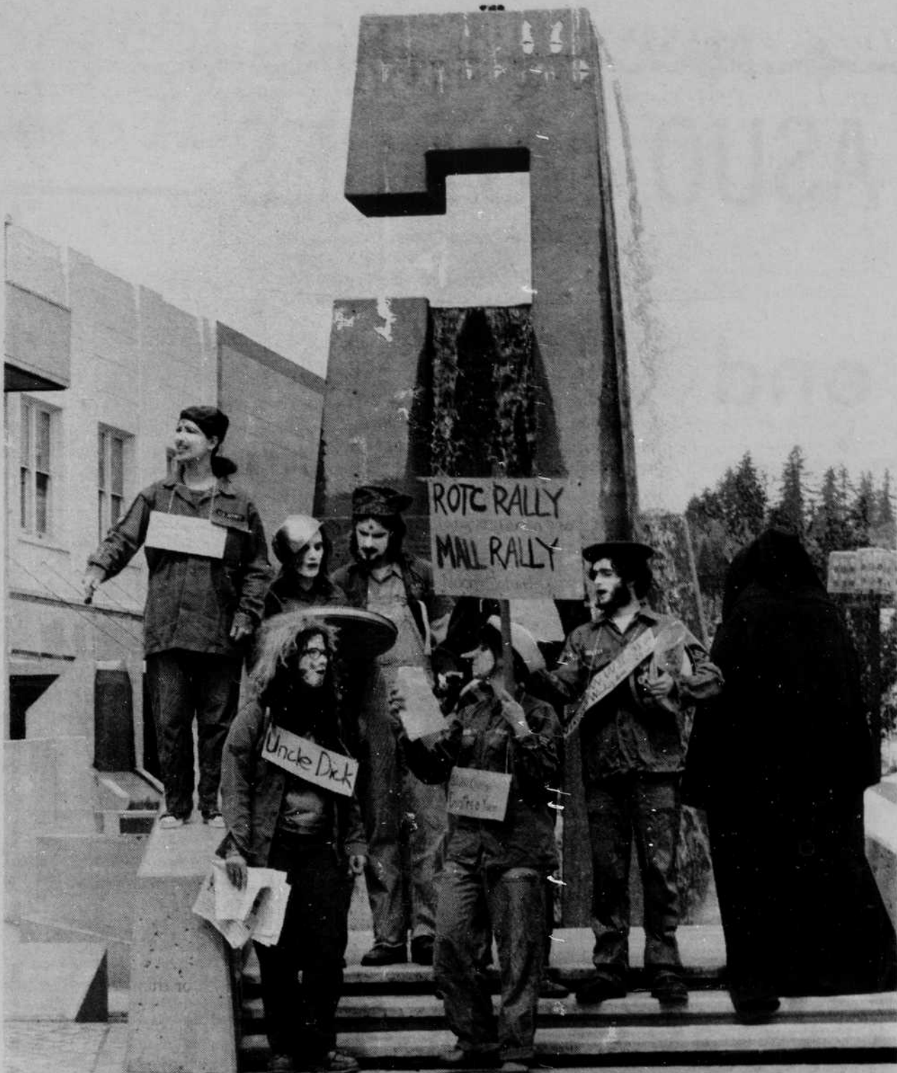
The Eugene Guerrilla Theater and the specter of death visited the Eugene Mall Thursday and sang songs of protest. The theater members marched through the mall and onto the armed forces recruiters shortly after noon.