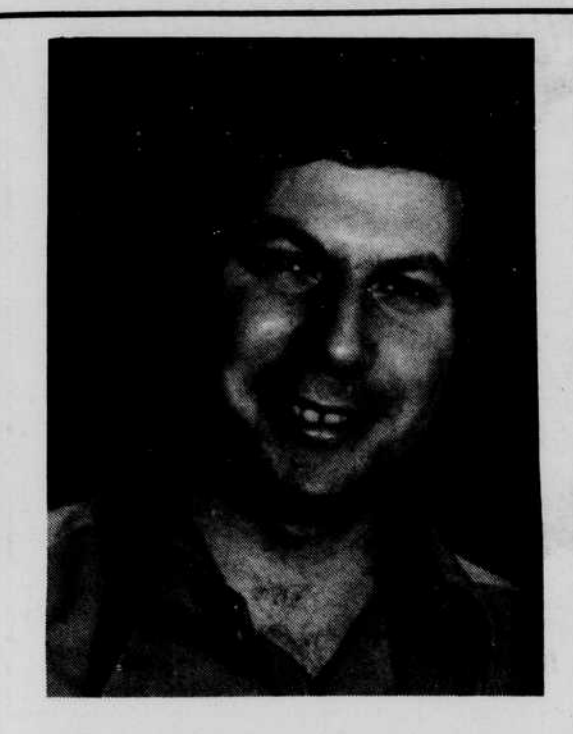
FURTHER PROOF THAT NOTHING CAN STOP AN IDEA WHOSE TIME HAS PASSED.

who said at a recent faculty meeting while discussing P.E. requirements: "If you could see the unfitness and ineptitude of the bottom half of our student body, you coudn't support this motion."