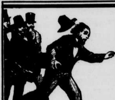
Find a place to stay before you get kicked out. Read Emerald Classifieds. And hurry!

In tennis, The People, Legal Eagles and Sigma Nu have advanced to the semi-final round.