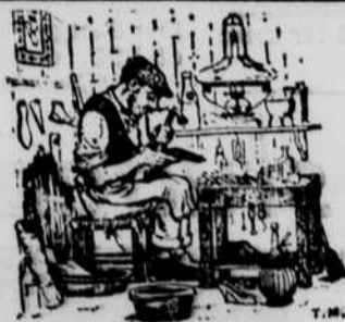
FROM THE LITTLE OLD SHOE MAKER