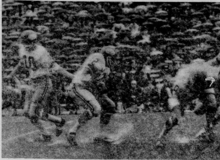
ASTROTURF AT UNIVERSITY OF WASHINGTON A yellow field with green stripes?