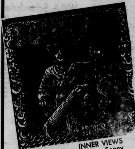
INNER VIEWS Sonny Atco 33-229