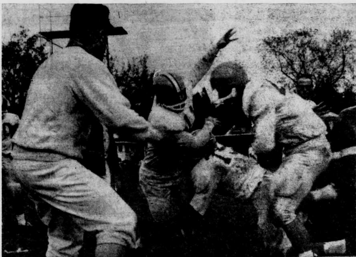
SPRING FOOTBALL practice is on now on the practice field behind Hayward Field. The players are preparing for the alumni game May 14. Practice began April 16.