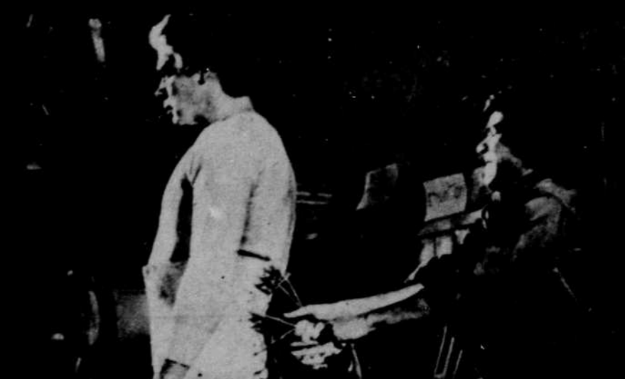
In tight places!