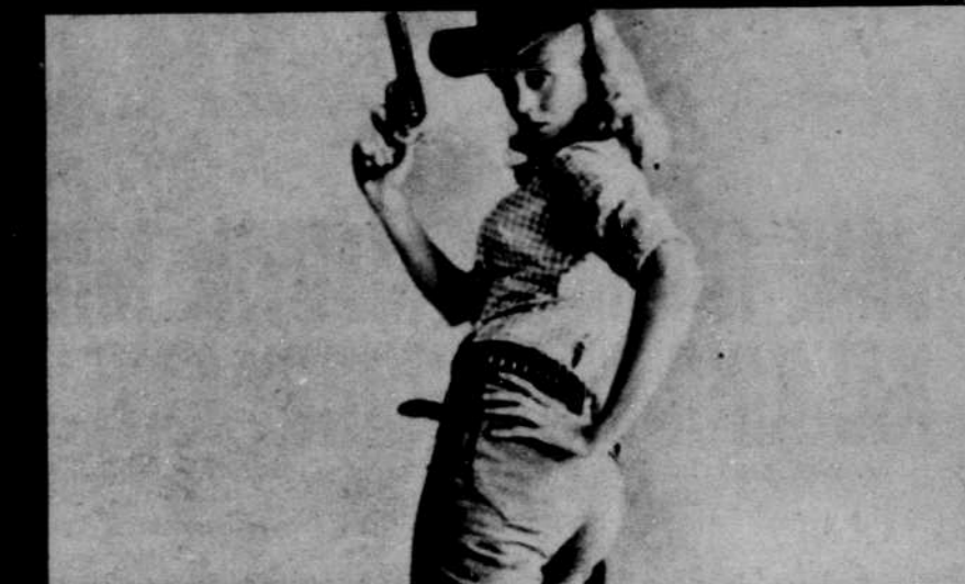
That ever went "bang-shucks-bang"!