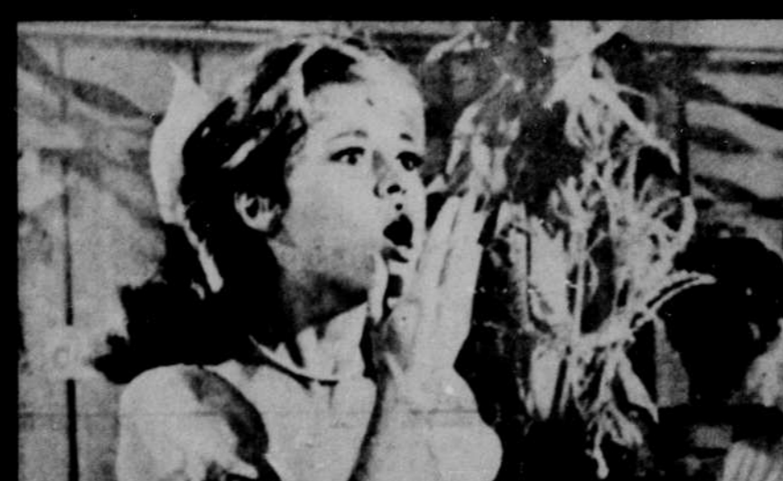
And whoop-it-up action...