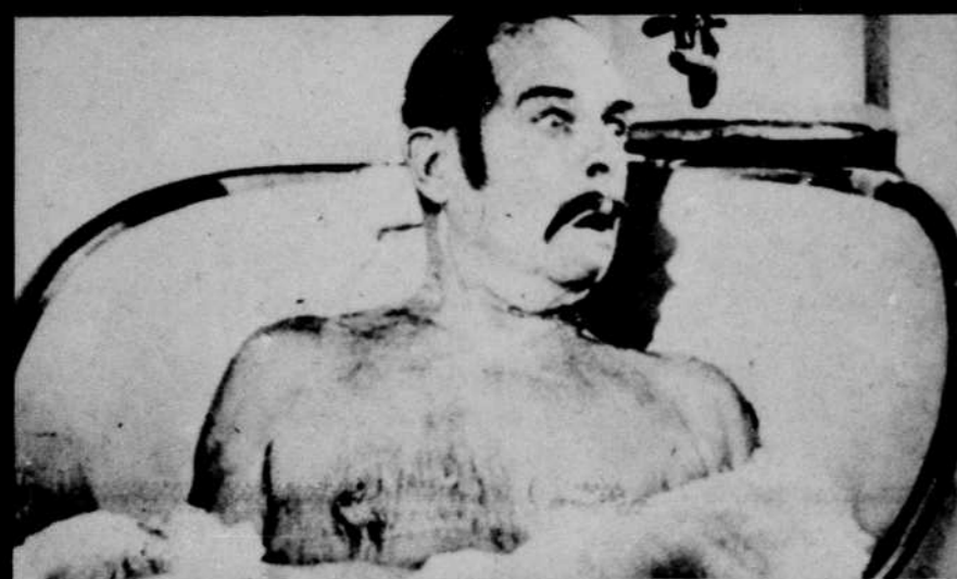
It's good clean fun...