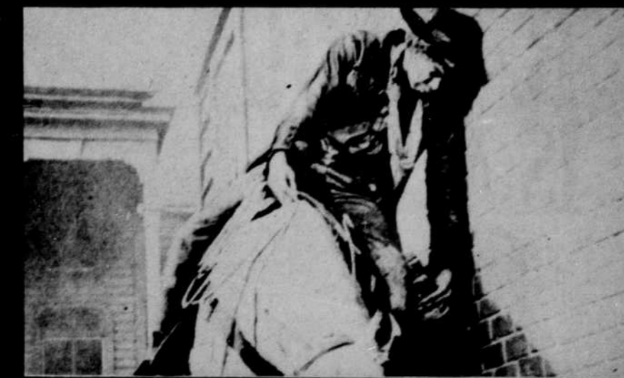
If it isn't a sleeper!