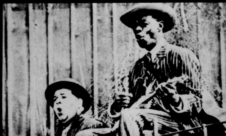
We'll put it into song...

Not only shootin'- but train robbin' and rustlin' and drinkin' and fightin' and some dang-busted fancy lovin' too!