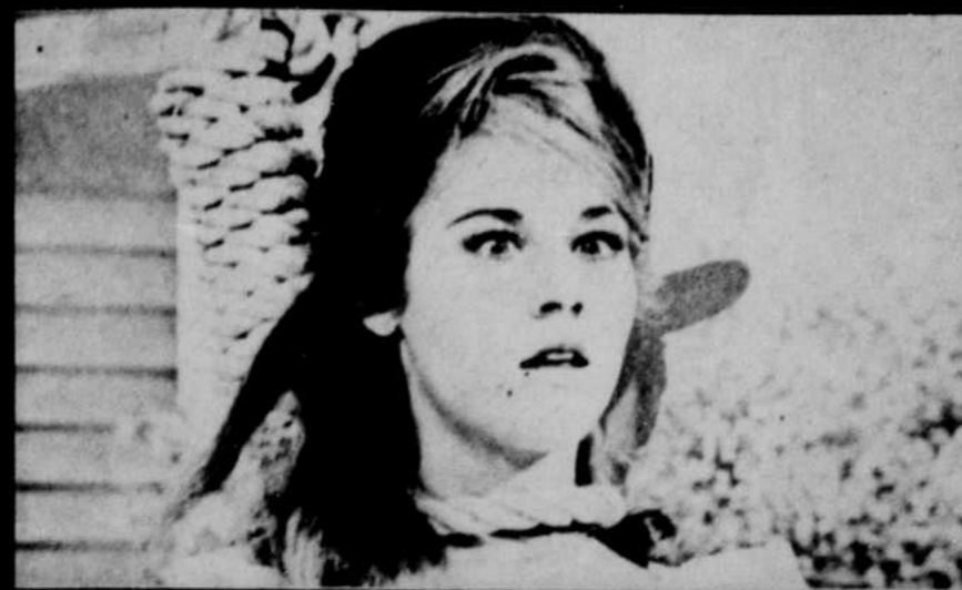
We'll be hanged...