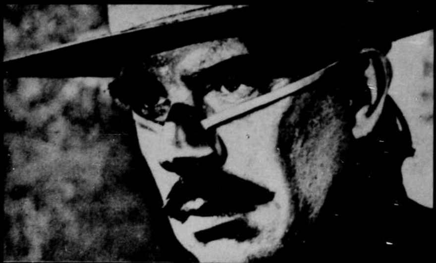
As everybody nose...