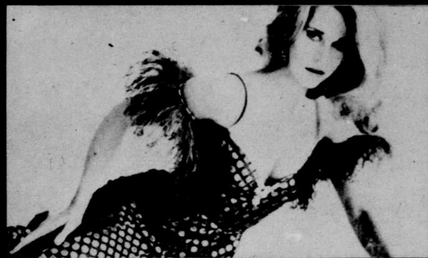
It's an open secret...