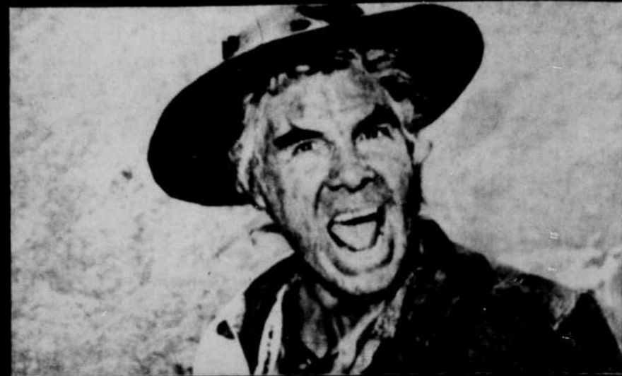
We'll shout it to the rooftops..