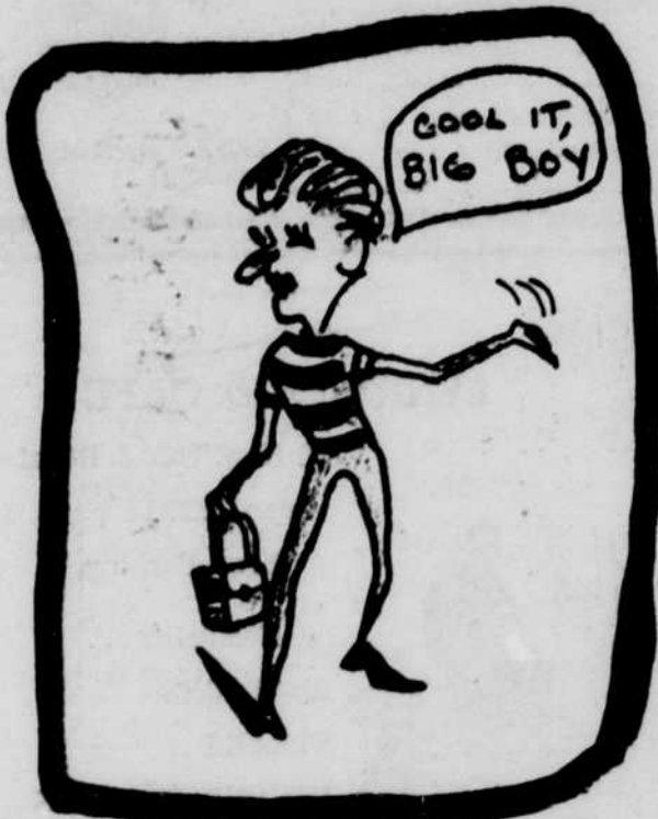
Different boys didn't even need him.