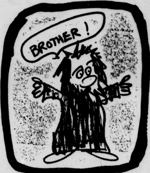
Waldo was accepted.

Don't be an old Waldo (unless your name happens to be Waldo) Be a new Waldo. Discover T-BIRDS. Flying is cheap, cheap, cheap! Call RUSS WELLER for information at 343-4536. Do it now! Be in!