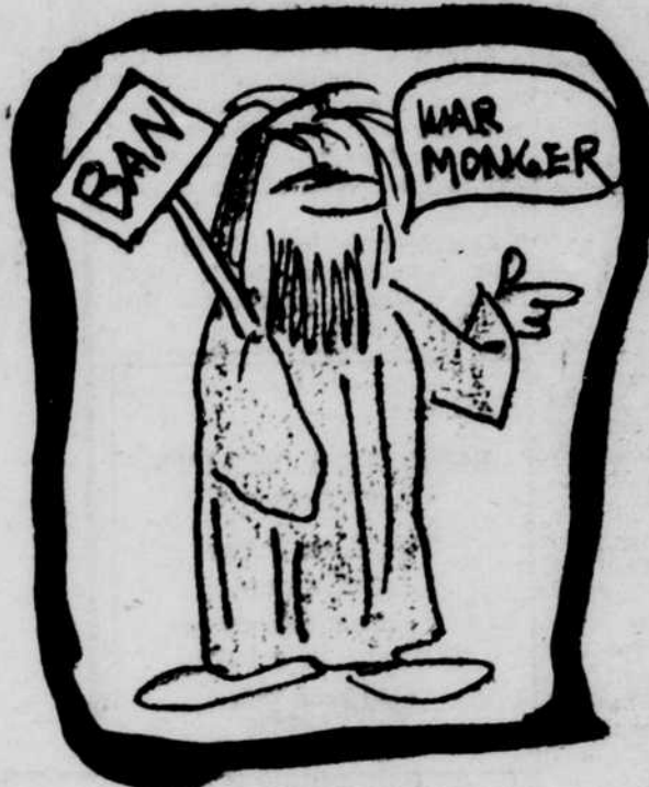
Not even Ban-the-Bombers.