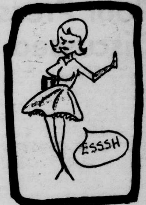
The chicks didn't need him.