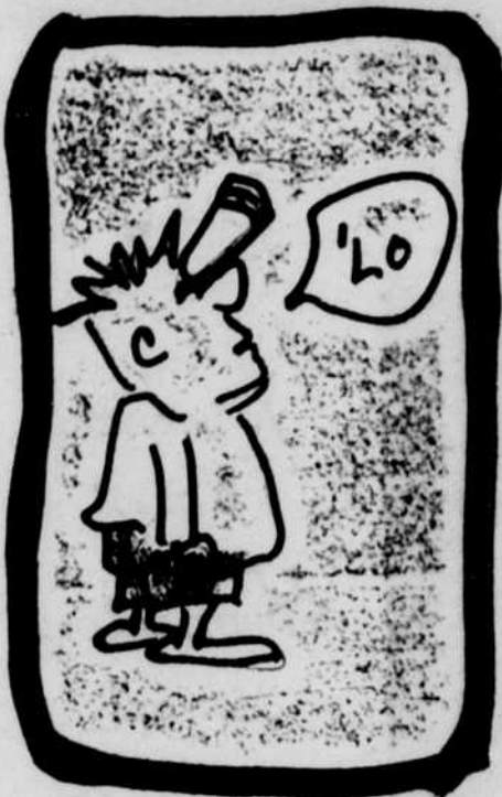
Then Waldo discovered T-Birds.