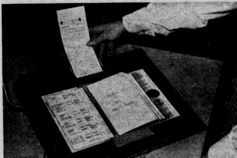
STEP ONE—To vote on the Votomatic, insert the IBM card all the way into the new electronic device.