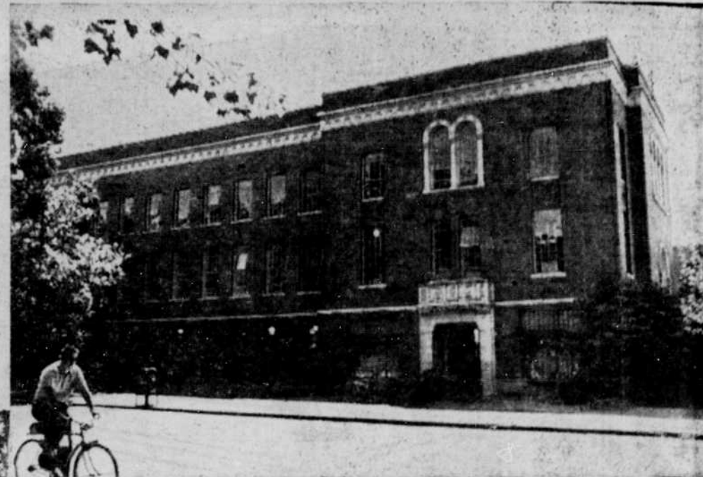
SUPPLY STORE — 1000 E. 13th AVE.

SHARE IN THE PROFITS Save Your Receipts JOIN THE CO-OP