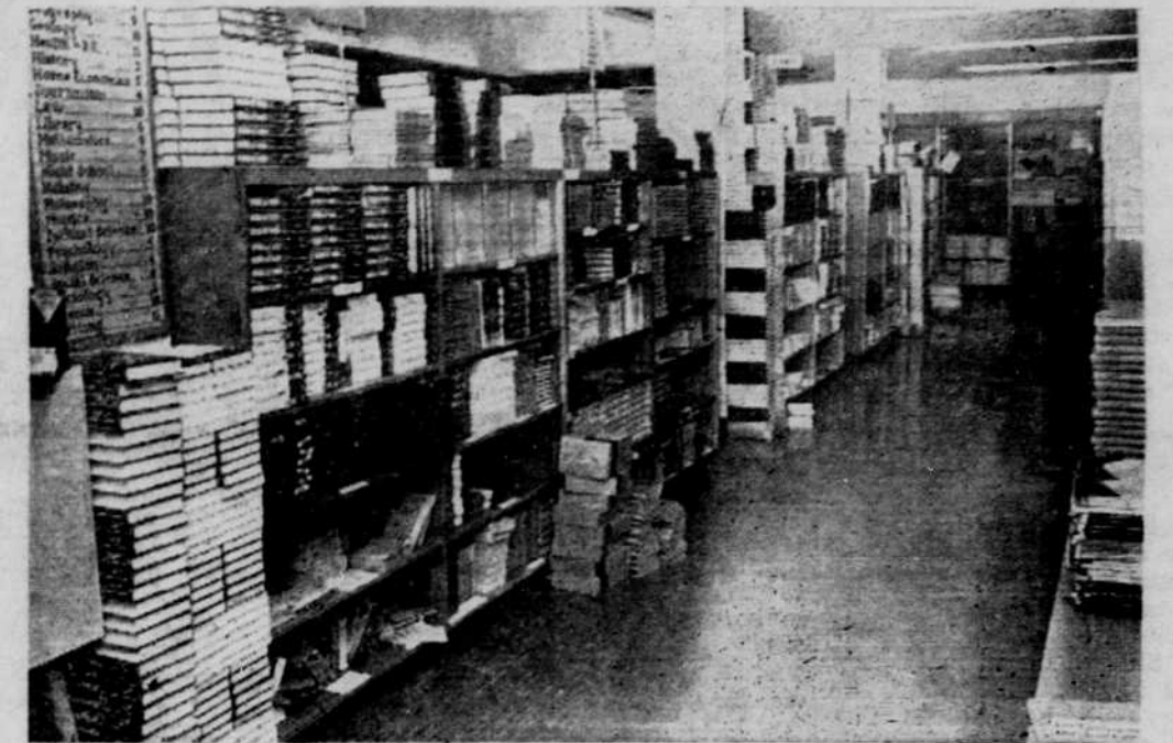
TEXTBOOKS — 2ND FLOOR BOOK STORE

TEXT BOOKS TRADE BOOKS SUPPLIES “Plus” IMPORTANT SAVINGS THROUGH PATRONAGE REFUNDS