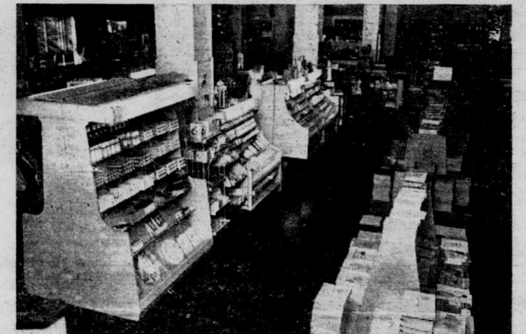
SUPPLIES IN CHAPMAN HALL (1000 E. 13th)

Students may join the Co-Op in Chapman Hall at the business office. Membership is 25 cents. The 10% rebate is granted at the end of spring term.