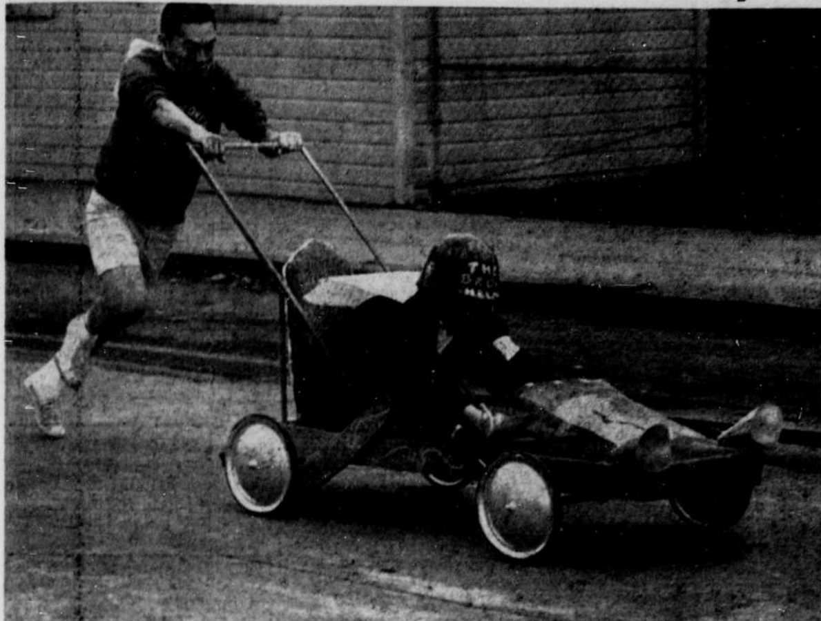
PUSH-CART RELAY contestants in last year's race charge (?) toward the finish line. Entry deadline for this year's races is April 30. Proceeds will be given to Pearl Buck School.