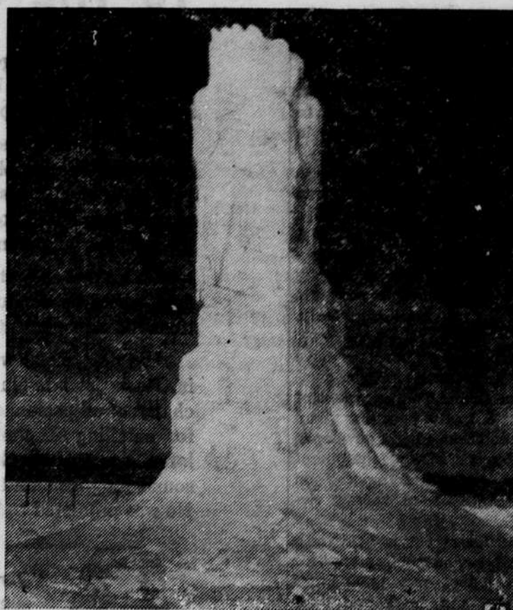
MAN MADE — This frigid formation, 35 feet tall and 20 feet wide, resulted when a Traverse City, Mich., airport manager, turned on a water sprinkler under a beacon tower.