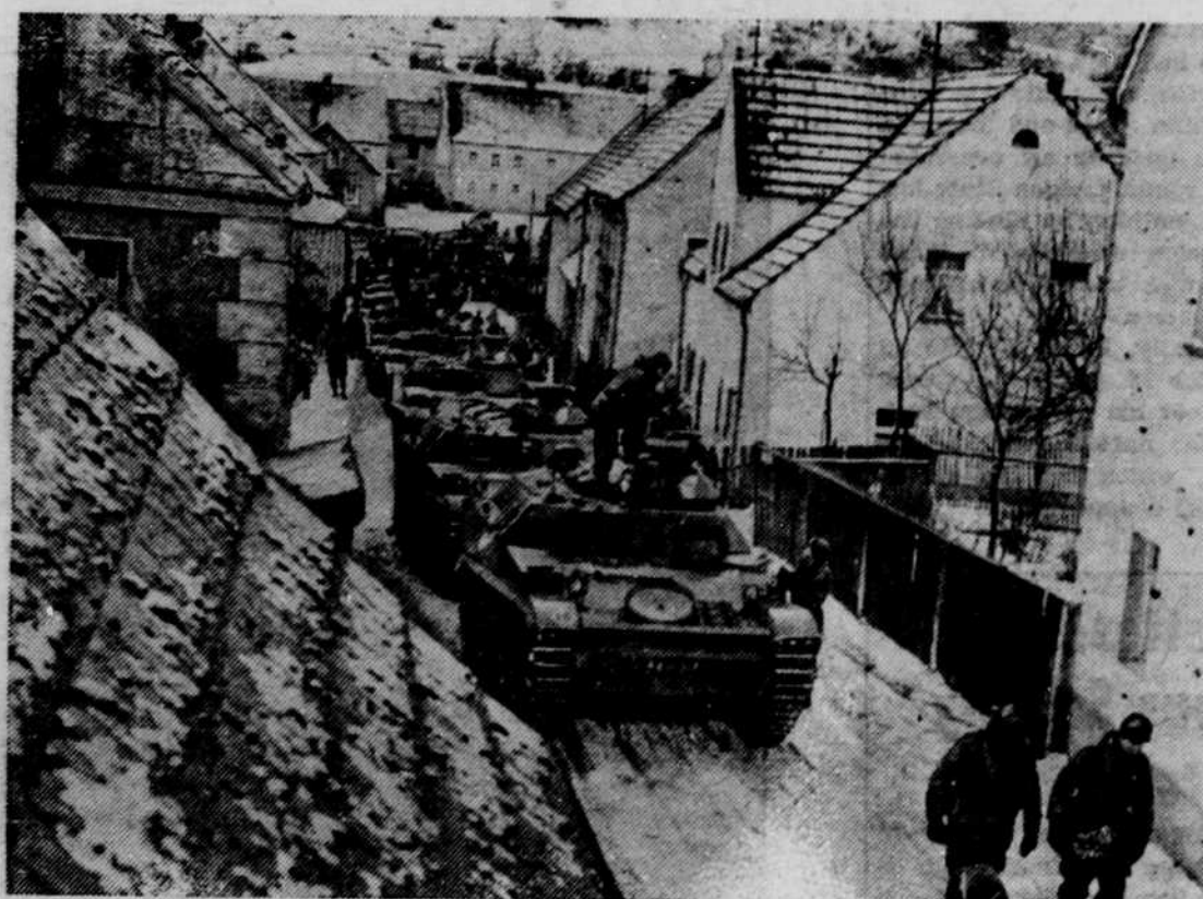
EASING THROUGH —Column of French tanks fills a narrow street during brief stop in the German village of Regensburg. They were en route to join several thousand American and West German troops engaged in "Winter Shield," NATO's big winter maneuvers.