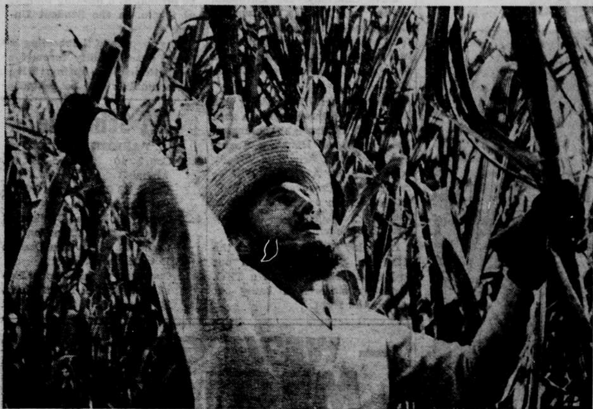
VOLUNTEER CANE CUTTER —Cuba's Prime Minister Fidel Castro went cane cutting with thousands of other volunteer workers on a Sunday, and official announcements said he sliced off over 9,000 pounds of cane. Foreign correspondents and photographers were barred, but this government photo shows him hard at work.