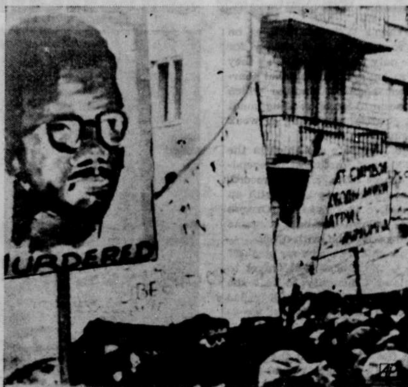
ANTI-BELGIAN DEMONSTRATION IN MOSCOW —Demonstrators carry likeness of slain Congo leader Patrice Lumumba and signs denouncing his killing as they parade in front of the Belgian embassy in Moscow on Feb. 14. Rocks thrown by the mob smashed windows and doors of building before police intervened.