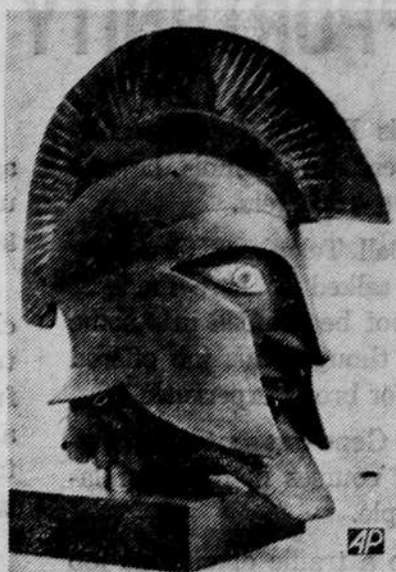
FAKE —This warrior's head is one of three large famous terracotta sculptures of warriors that the New York Metropolitan Museum of Art has discovered are fakes. They had been labeled "Etruscan", of about the fifth century, B.C., and had been on exhibition at the museum since 1933. A notice posted in the Etruscan collection says that as a result of modern scientific analyses the museum received "proof that these famous statues were not made in ancient times."