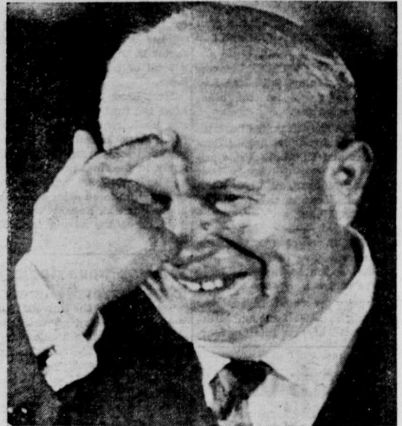
KHRUSHCHEV MAKES A POINT —Soviet Premier Nikita Khrushchev smiled broadly and tapped his forehead during news conference at the Palais de Chaillot in Paris Wednesday. He challenged President Eisenhower's assurance that U.S. spy plane flights over Russian territory will not be resumed.