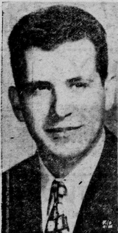
PILOT of downed plane, Francis Powers, 30, has been identified as the pilot of the U2 plane believed shot down over the Soviet Union. He is a native of Pound, Va.