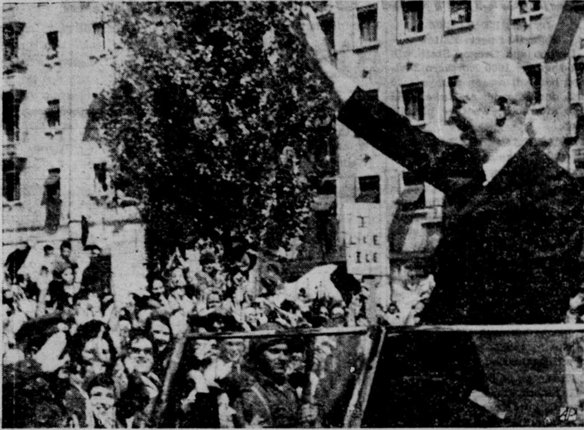
LISBON HAILS IKE —President Eisenhower responds to cheers of Portuguese crowds in Lisbon Thursday on his way from airport after a flight from Paris. One of the greeters holds an "I Like Ike" sign aloft.