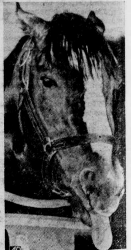
'TLL DO IT AGAIN' —Sunny Blue Farm's Venetian Way, the Kentucky Derby winner, defiantly displays his attitude concerning his rivals in the Preakness at Pimlico Saturday. The colt is favored to take the second leg in the Triple Crown series.