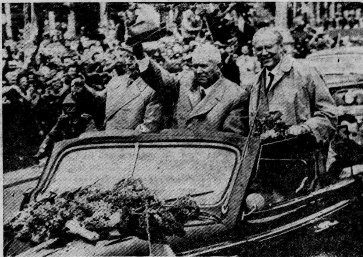
KHRUSHCHEV ARRIVES IN EAST BERLIN —Soviet Premier Nikita Khrushchev, fresh from the wrecked summit talks in Paris, waves hat from open car following his arrival Thursday in East Berlin. Beside him are East German Communist leader Walter Ulbricht, left, and Premier Otto Grotewohl. Khrushchev spoke soothingly to East Berliners about another summit conference in six to eight months. They're riding along East Berlin's Stalin Allee.