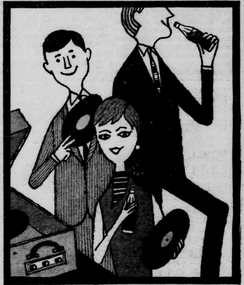
"COKE" IS A REGISTERED TRADE-MARK. COPYRIGHT 1957 THE COCA-COLA COMPANY.