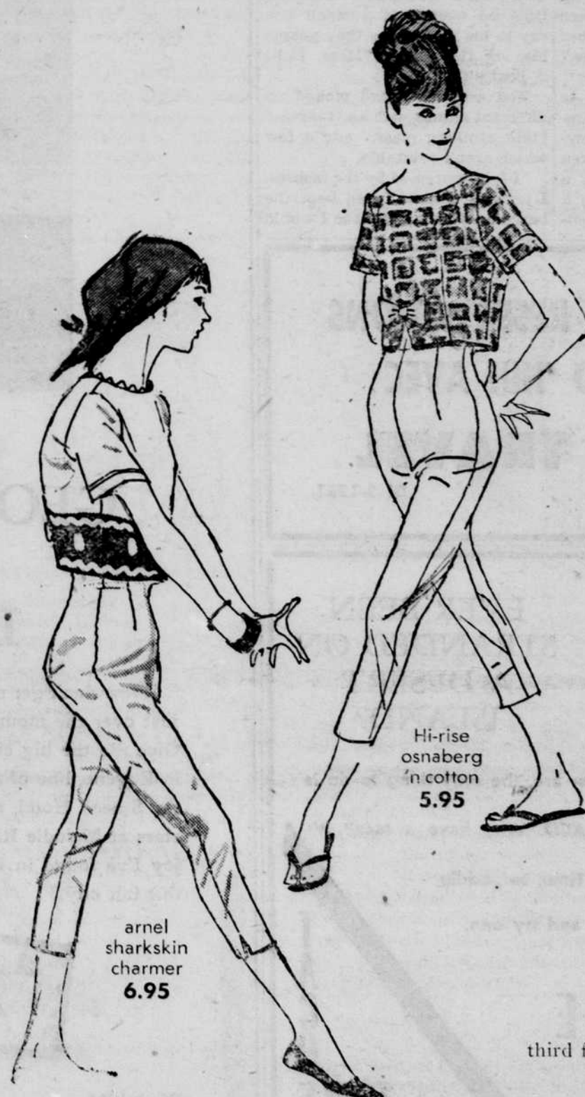
Hi-rise osnaberg 'n cotton 5.95