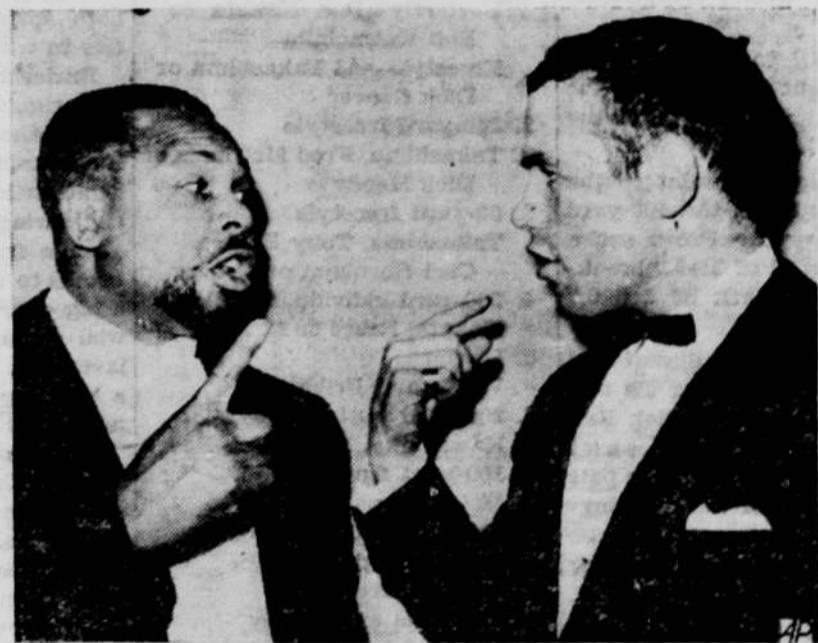
VETERAN LIGHT-HEAVYWEIGHT champion Archie Moore used his right to good advantage in this animated conversation with heavyweight champion Ingemar Johansson at a dinner in New York City.