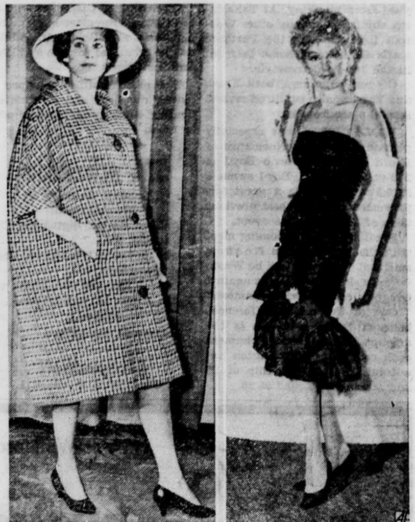
FOR THE SPRING SEASON —These two creations among the fashion highlights for the spring of this year. At left is key-checked wool coat featuring the new melon silhouette. It was designed by Monte-Sano. Right is figure-molded short evening dress by Ben Reig. It is skin-tight, bare-topped, and all-shirred sheath with distracting "flirt flounce" with a diamond brooch at hemline.