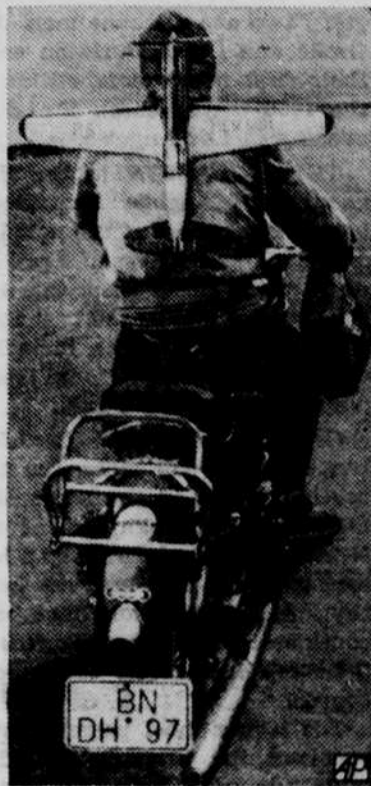
SET TO FLY —A novel sight in Bonn, Germany, was this motorcyclist with wheels on ground and wings on his back. He was going to a model plane contest.