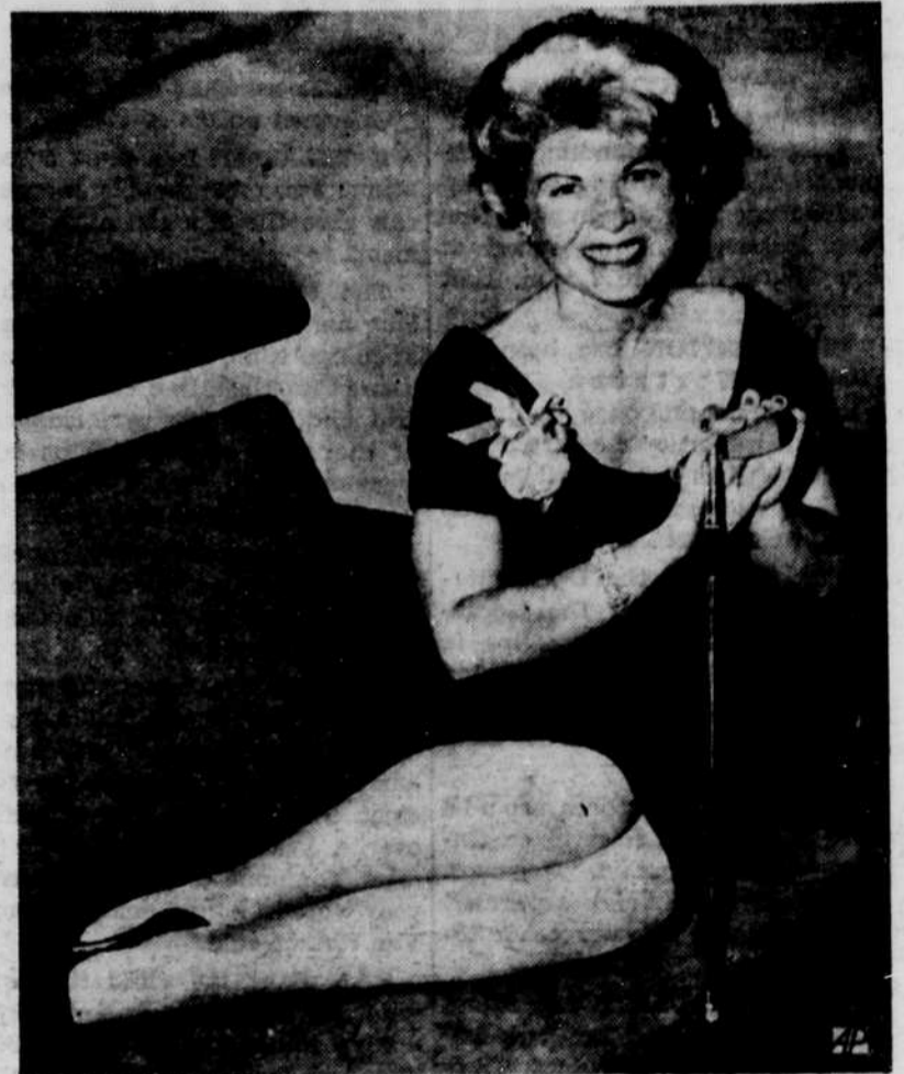
BARBARA ROMACK , former national amateur golf champion, shows an example of what she means when she says the touring women golfers are starting to look as good as they swing. The pert blonde from Sacramento, California, who is now in the pro ranks, said in New York City that women golfers have learned that fans want more than a good shot—they want sex appeal on the course.