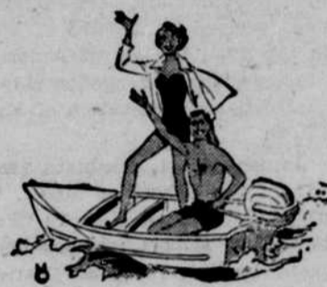
"Probably the Best"

Frank Lary, the old Yankee nemesis, was up to his tricks again, beating the New Yorkers for the second time this year and the eighteenth time in his career.