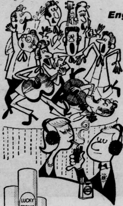
English: HIP SINGING GROUP

Thinklish translation: These guys are so far out, they wear space helmets. They never ask, "How High the Moon?" They know. When there were seven of them, they were a heptet. But since they've added a man, simple arithmetic makes them a rockett! Naturally, when they take ten, they take Luckies. Like anyone else (square, round or what-have-you), they know all about the honest taste of fine tobacco. Consensus: flipsville!