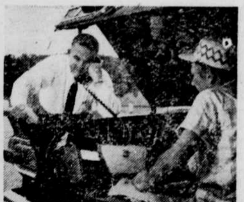
"11:00 a.m. As soon as things are lined up at the office, I drive out to check on the mobile radio repair job. The repairman has found the trouble—and together we run a test on the equipment."