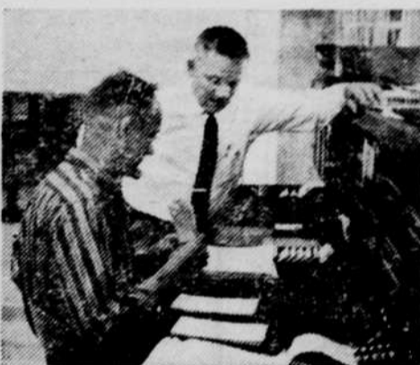
"9:10 a.m. The State Police at Andover have reported trouble with a mobile radio telephone. I discuss it with the test deskman. Naturally, we send a repairman out pronto to take care of it."