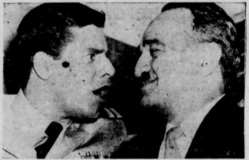
COMEDIAN JERRY LEWIS, left, goes into his act as he was introduced to Russia's Deputy Premier Anastas I. Mikoyan, asking "Is this the guy?" Mikoyan, who doesn't speak English, maintained his composure for a moment, then burst into laughter. They met at Paramount Studio, Hollywood, where Lewis is playing the role of Navy officer.