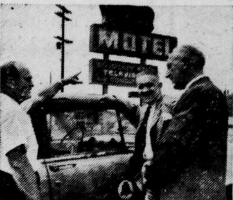
"1:30 p.m. After lunch, I look in on a PBX and room-phone installation at an out-of-town motel. The installation supervisor, foreman and I discuss plans for running cable in from the highway."