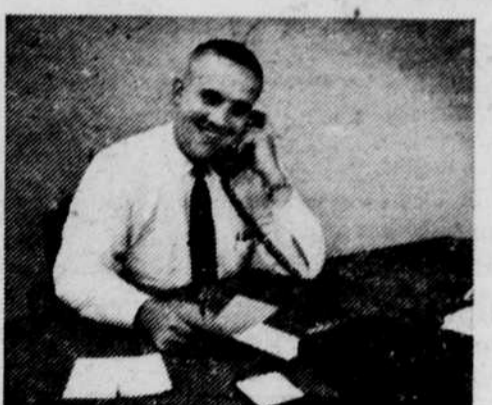
"4:00 p.m. When I get back to my office, I find there are several phone messages to answer. As soon as I get them out of the way, I'll check over tomorrow's work schedule—then call it a day."