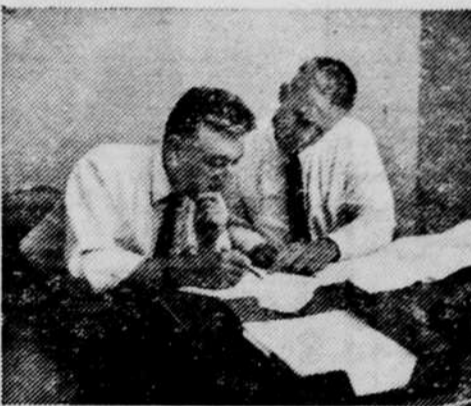
"8:30 a.m. With my test bureau foreman, I plan work schedules for the coming week. Maintaining equitable schedules and being ready for emergencies is imperative for good morale and service."