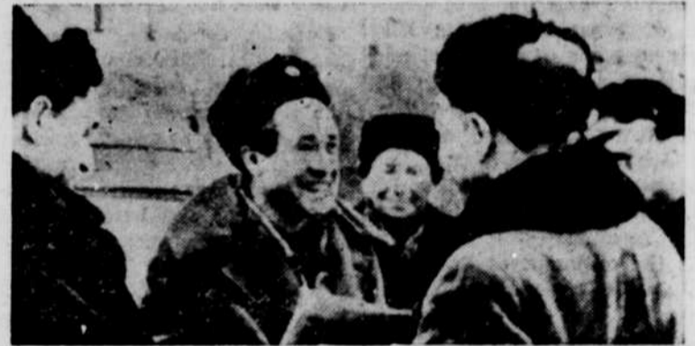
FUR CAPPED MUSCOVITES, all smiles at the news, discuss the new Soviet cosmic rocket on a street in the Russian capital.