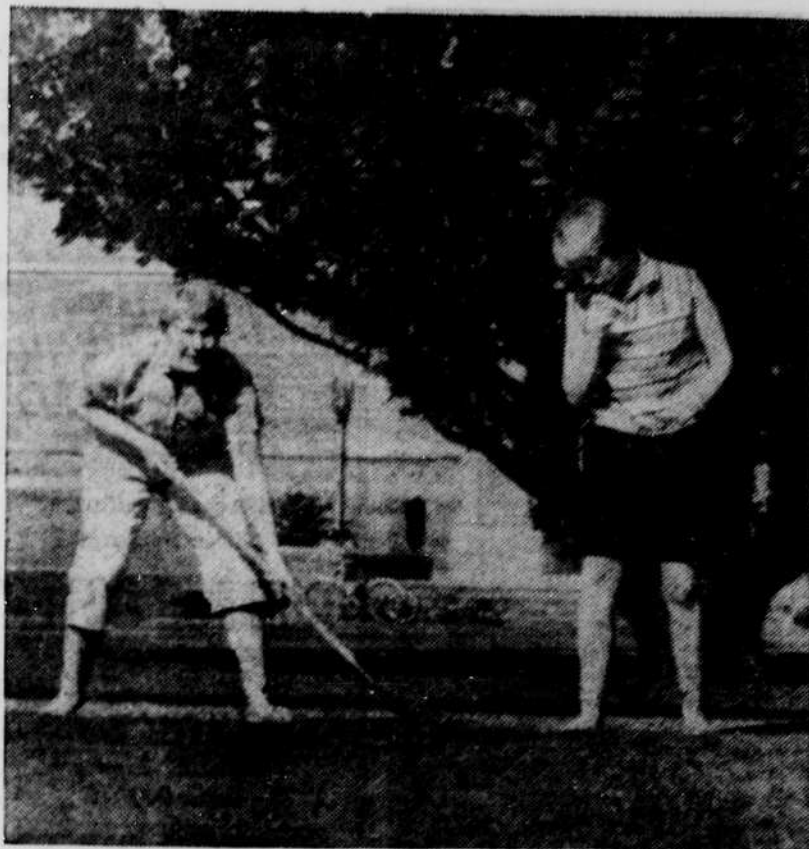
THESE TWO DZ's worked hard Thursday afternoon on the All-Campus Clean-up. First place honors went to Alpha Chi Omega and Tau Kappa Epsilon.