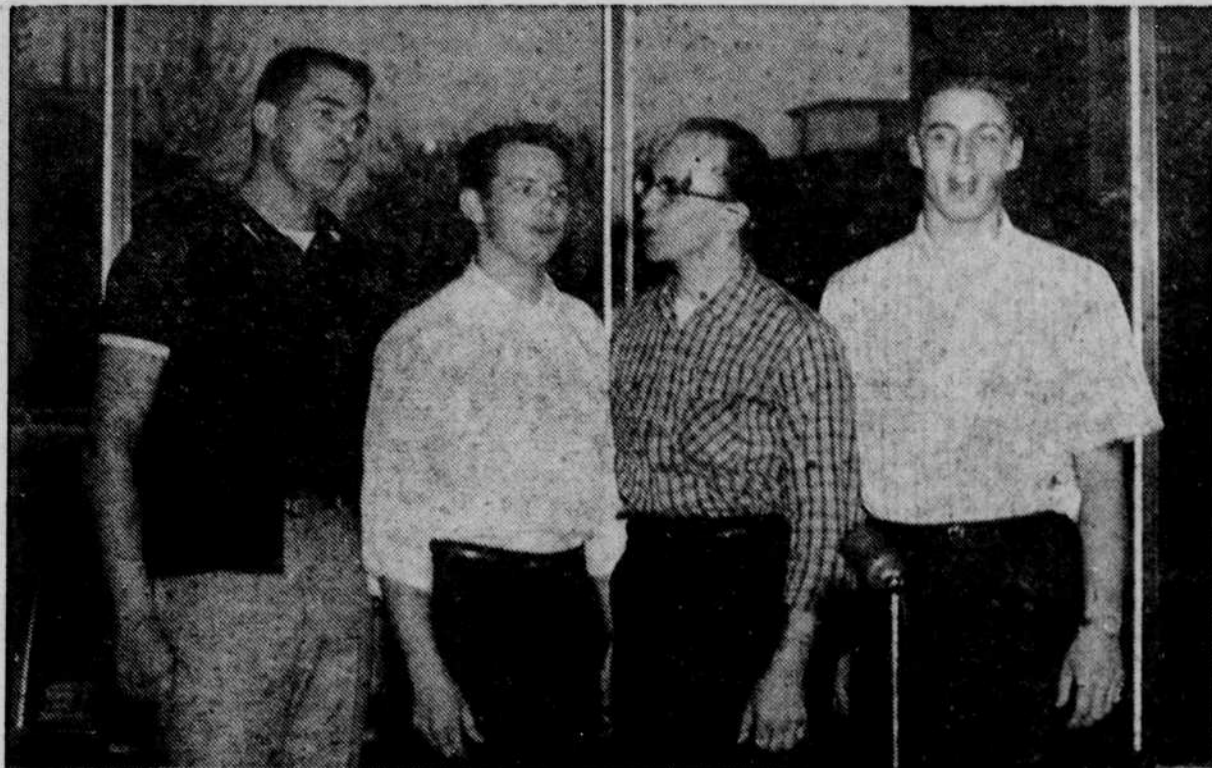
THE SIGMA PHI EPSILON quartet, winners of this year's quartet contest were sold to Chi Omega sorority for $16.00 at the World University Service auction Friday afternoon.