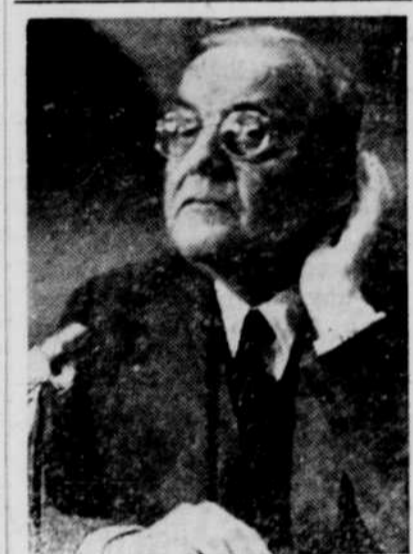
SECRETARY of State Dulles cups a hand to an ear as he listens to an outline of proposed legislation read to him by Chairman John Pastore (D-RI) of the Senate-House Atomic Energy Subcommittee. In this testimony before the group Dulles said the United States must share atomic weapons secrets with its allies to keep the Soviet Union from dominating them with nuclear superiority.