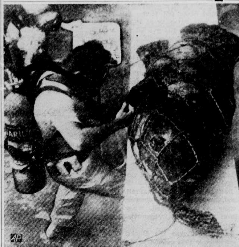
VETERINARIAN Robert Knowles is shown performing surgery under water on "Old Abe" the Miama (Fla.) Senquarium's 500-pound jewfish, which appeared to be suffering from a tumor. But the operation—termed successful—produced not a tumor but a five-pound weight swallowed by Old Abe sometime ago. The fish is eight or nine years old.