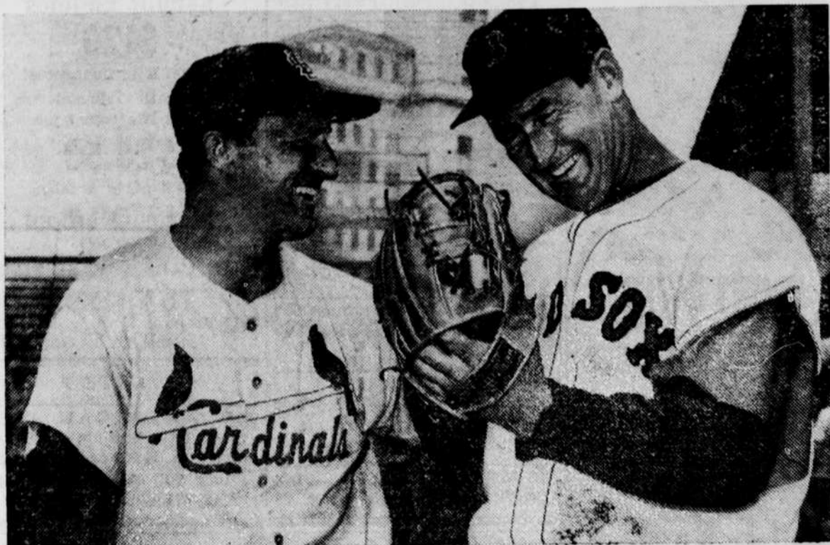
TWO OLDTIMERS, Stan Musial of the Cards and Ted Williams of Boston, a pair of perennial batting champs, chat prior to exhibition game at Sarasota, Florida.