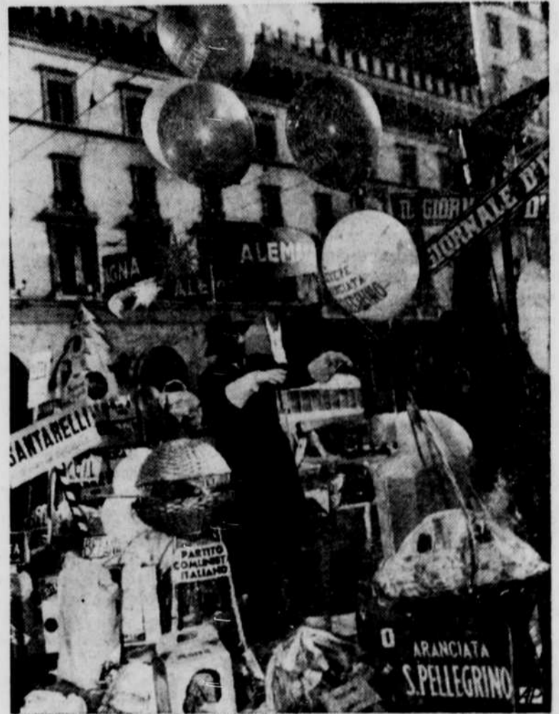
TRAFFIC COP in busy room square is hard to find amid gifts presented to the police force by motorists on Epiphany, the traditional gift-giving day in Italy.