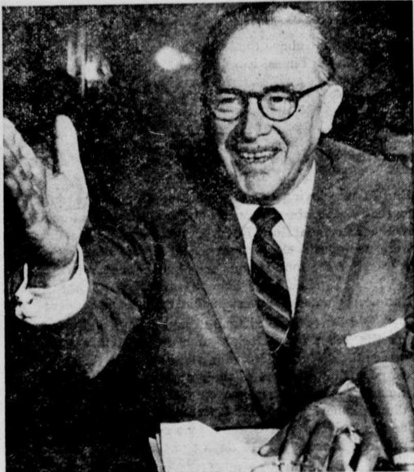
SECRETARY OF AGRICULTURE Ezra Taft Benson gives a wave with a confident smile after taking witness chair in Washington, at the start of Senate Agriculture Committee hearings on the new administration farm program. The program, already under fire on Capitol Hill, calls for a lowering of minimum price supports on basic commodities.