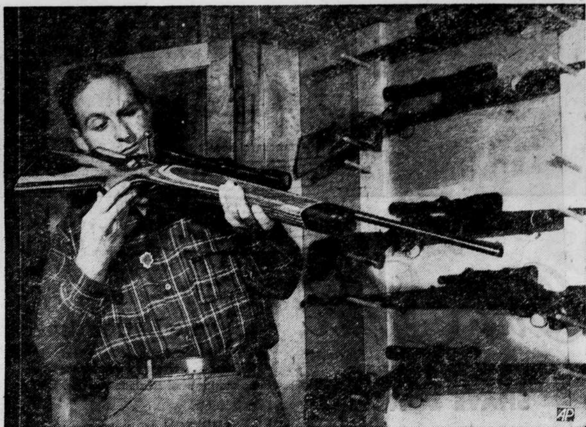
COMEDIAN SID CAESAR, who is returning to television, examines a rifle from his collection of target-shooting weapons at his King's Point, N.Y., home.