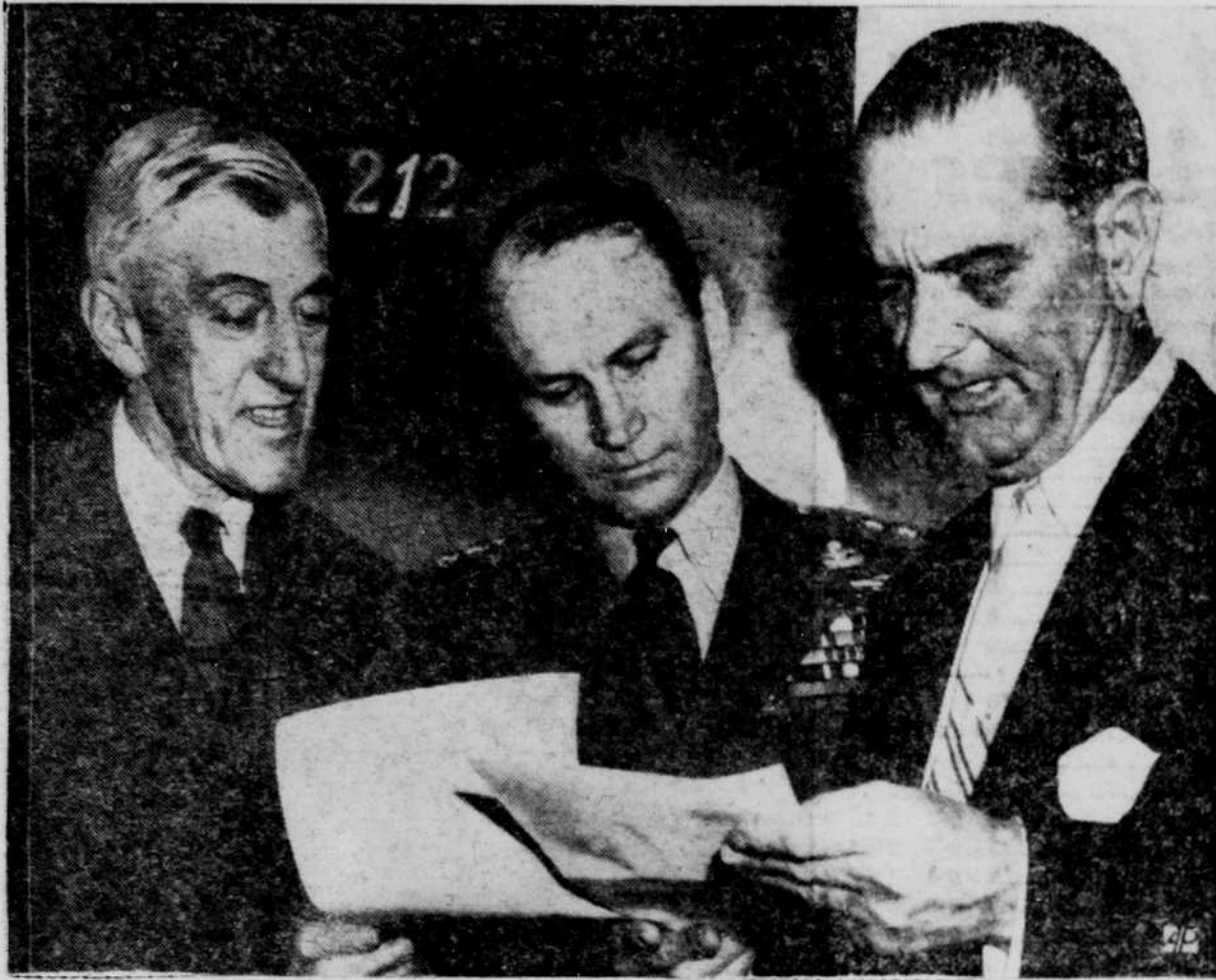
GEN. JAMES M. GAVIN, center, goes over papers with Sen. Leverett Saltonstall (R-Mass), left, and Sen. Lyndon Johnson (D-Tex). Gavin, army research and development chief who has announced plans to retire, met behind closed doors with the Senate Preparedness Subcommittee looking into the U.S. missiles and satellite programs. Gavin has blamed the "Pentagon system" for slowing up development of new weapons.