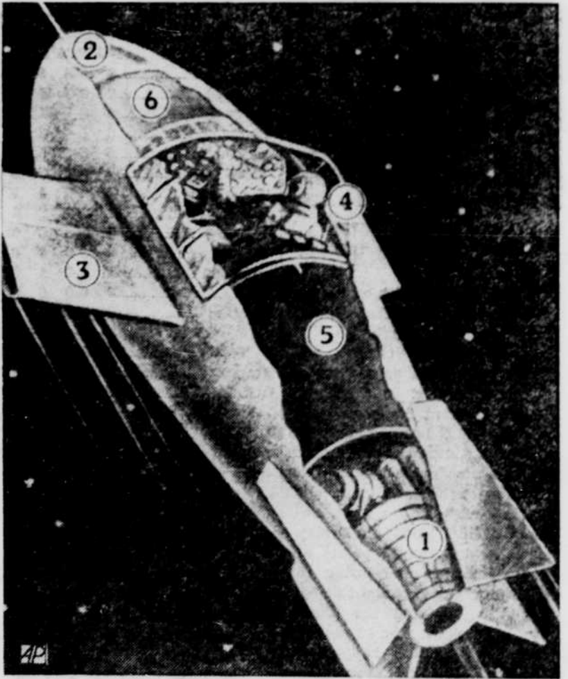
CAPTION FOR THIS drawing taken from "Journey into the Cosmos," published in Moscow in 1955, is headed "perhaps this is how the first manned artificial satellite would look." It consists of jet motor (1); parachute (2) for braking its descent; movable wings (3) for gliding; hermetically sealed pilot's cabin (4) made of synthetic glass and equipped with metallic blings to protect pilot from burns by sun's rays; tanks for fuel (5); and oxydizer (6) for operation of jet engines in case of need to increase speed of flight when retarded by air resistance, and also for landing.