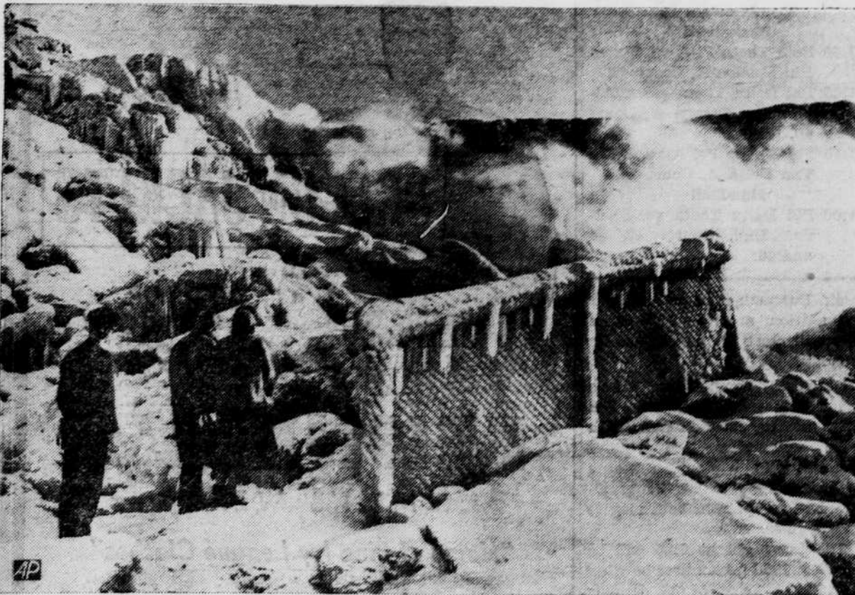
NIAGARA FALLS WEARS its winter coat of ice grown annually from freezing spray tossed up by the cataract. Sightseers are dressed for waterproof warmth. Ice on fence is four inches thick. Photo was taken at foot of American Falls.